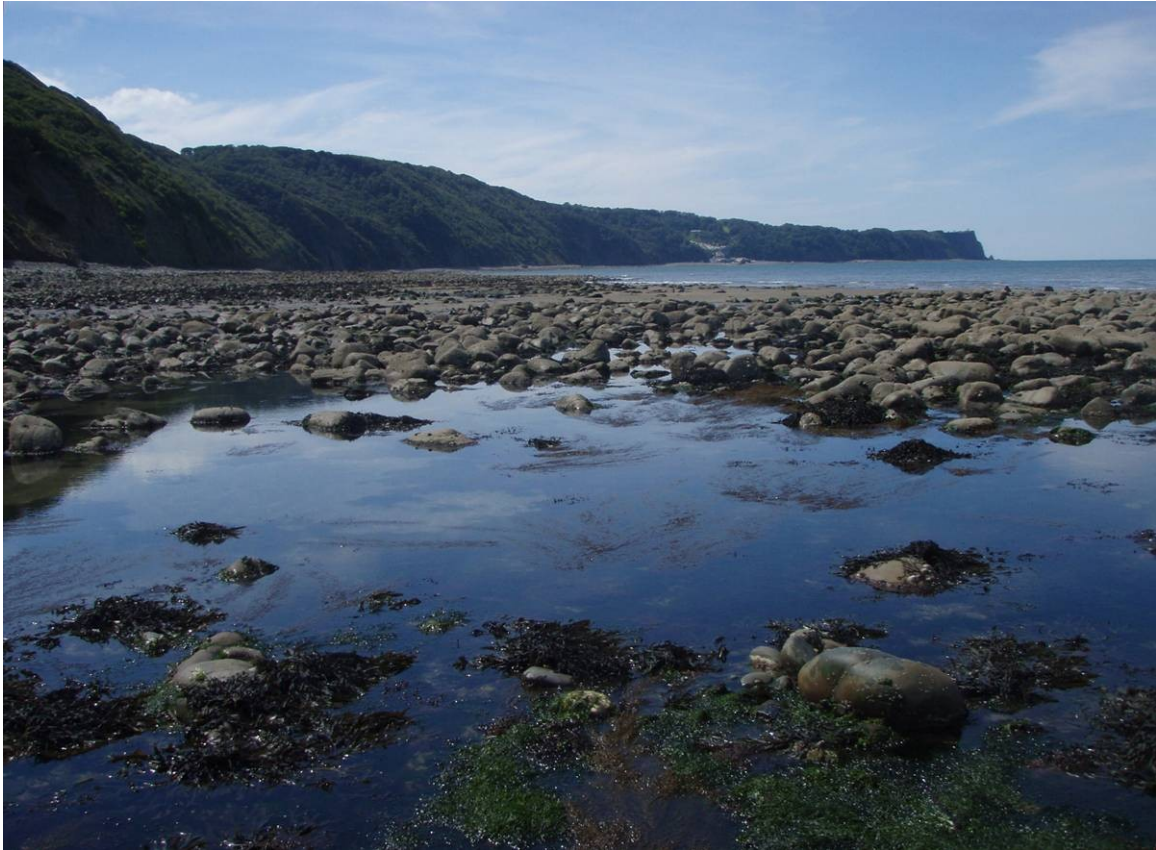
View from the Gore towards Hartland Point